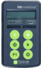
T24-HA Wireless display for connection to up to 12 load cells