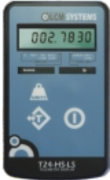
T24-HS-LS Simple wireless display for connecting to 1 load cell