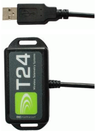
T24-BSu Wireless USB connected base station