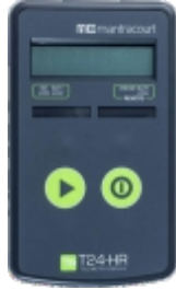
T24-HR Wireless display for connecting to multiple load cells