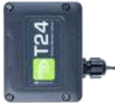
T24-BSue Wireless USB extended range base station