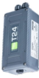
T24-SO Wireless serial ASCII output module