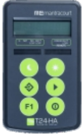
T24-HA Wireless display for connection to up to 12 load cells