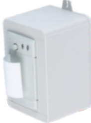
T24-PR1 Wireless surface mounting tally roll printer