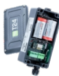
T24-AR Wireless range extender repeater module