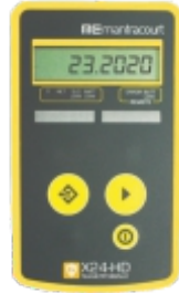
X24-HD ATEX Wireless display for connection to up to 24 load cells